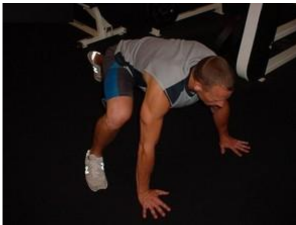
Mountain Climbers shown above

After finishing each exercise, rest about 30 seconds before starting the next exercise. Rest about 1-2 minutes after completing each "tri-set" before repeating.