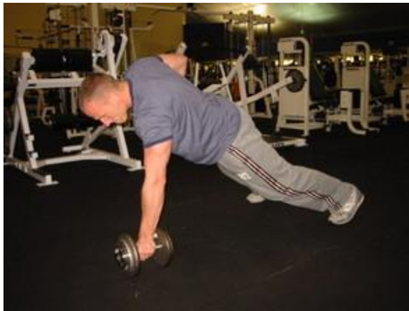
Renegade Rows shown above

Front squats are done similar to back squats, however with the barbell in front of your body on the front of your shoulders instead of resting on the upper back as in back squats. You stabilize the barbell on your shoulders by crossing your arms and pushing your fists into the bar against your shoulders while keeping your elbows out in front of the body.