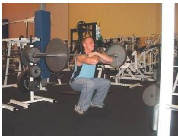
Front squats shown above

Mountain climbers are done by starting in a pushup position and then shuffling your feet in and out so that your knees are moving in under your chest and then back out to starting position. It sort of resembles climbing a mountain but flat on the floor. If you want an advanced version, you can also shuffle your hands 8-10 inches forward and backward in addition to the leg movements. This really makes it a full body exercise and MUCH more difficult than standard mountain climbers.